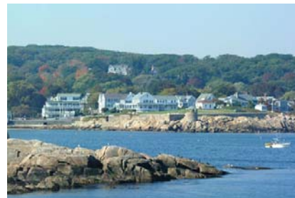
A scene from Rockport, Mass.!