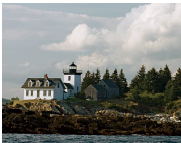
A scene from Rockport, ME