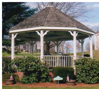
DGE Steve's home town of North Reading.