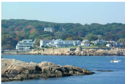
A scene from Rockport, Mass.!