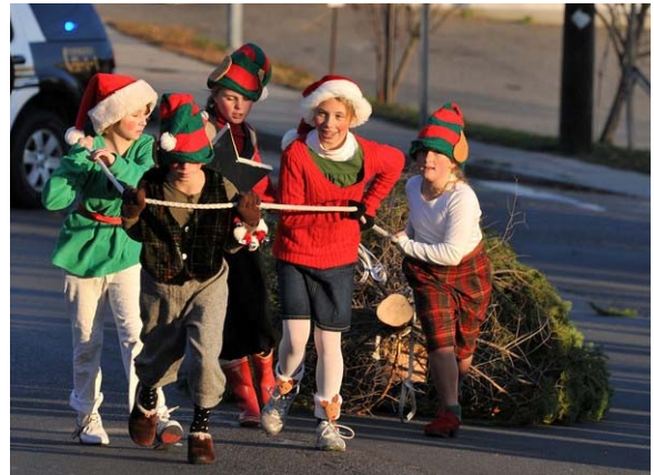
Gloucester children come in third place in the Gloucester Santa parade. Gloucester Rotary had a back up vehicle just in case the kids petered out.